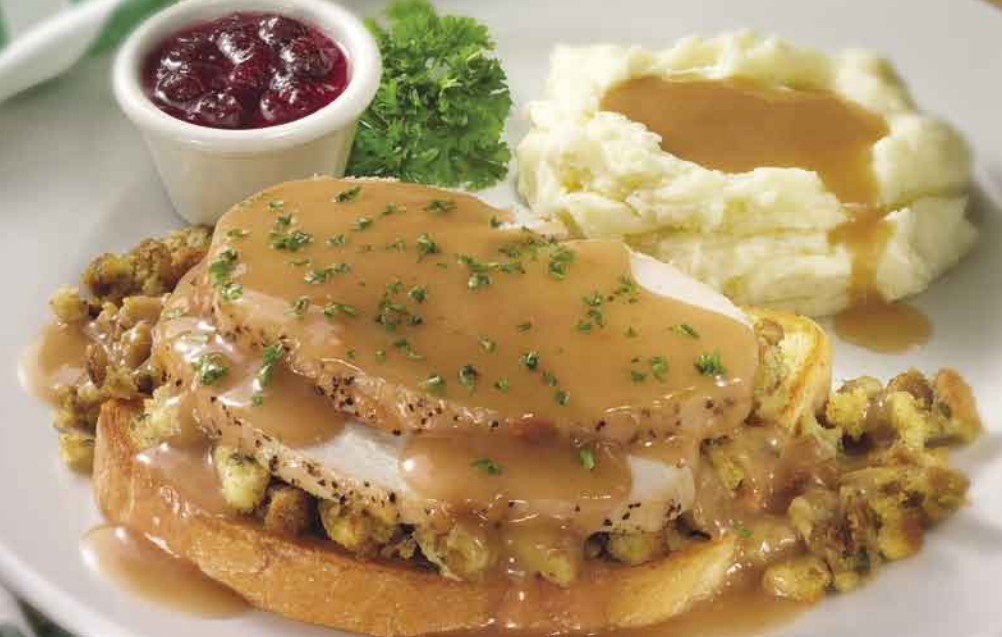
Open-Face Turkey Sandwich