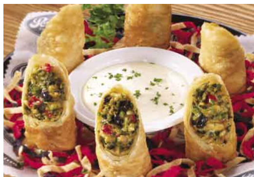
Santa Fe Mini Chimi's