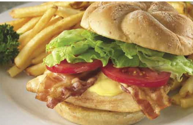
Bacon 'n Honey Mustard Chicken

Bacon, American cheese, lettuce, tomato and zesty BBQ sauce, all on a grilled chicken breast.