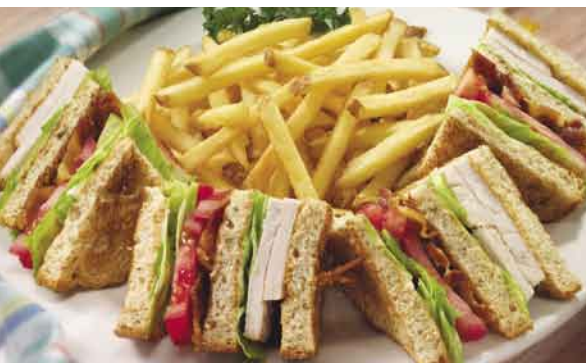
Triple Decker Club

Served with choice of fries, side salad, cup of soup or fresh fruit (excludes Open-Face Sandwiches).