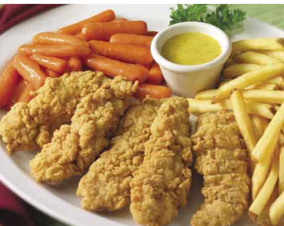
Chicken Crisp Platter