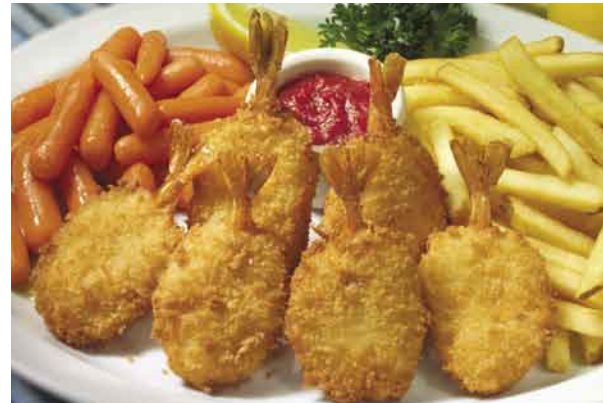
Jumbo Shrimp Dinner

A generous portion of jumbo butterfly shrimp, breaded and deep-fried. Served with zesty cocktail sauce.