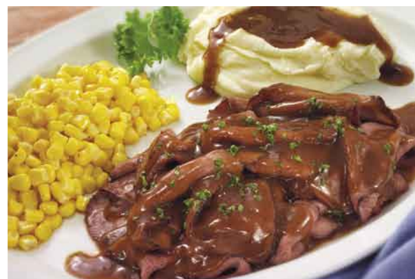
Roast Beef Dinner

This lightly breaded steak is fried golden brown and smothered with our own country-style gravy.