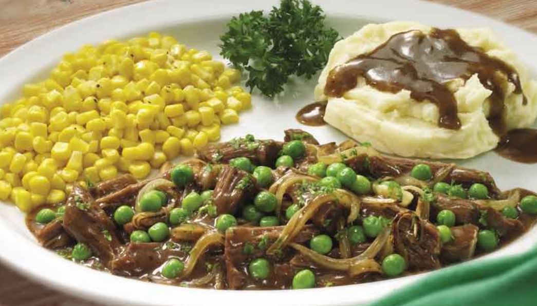
Homestyle Pot Roast