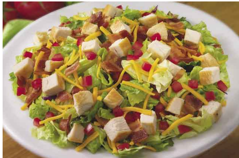
BLT Chicken Breast

Spicy blackened chicken, black olives, red onions, tomatoes, red and green peppers, Monterey Jack and cheddar cheeses. Served with Ranch dressing and crunchy confetti straws in our crispy-fried tomato tortilla shell.