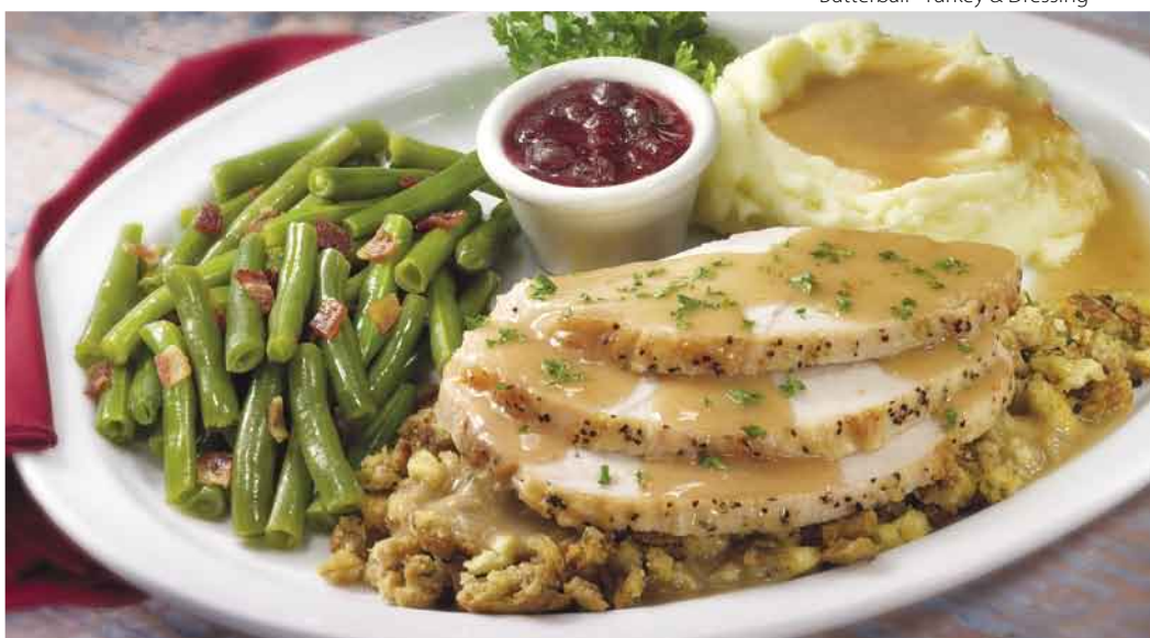
Butterball® Turkey & Dressing

Thick and hearty, topped with sautéed mushrooms and rich beef gravy.