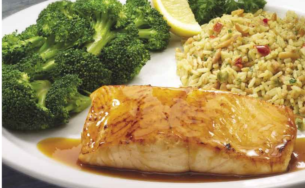
Apricot Teriyaki Grilled Salmon