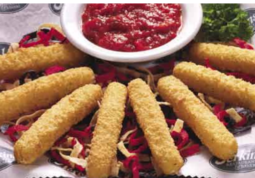
Zesty Mozzarella Sticks

A generous portion, lightly battered and fried to crispy perfection.