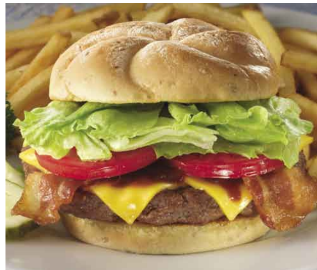
BBQ Bacon Supreme Burger

Choice of American, Swiss or Pepper Jack cheese, served with lettuce and tomato.