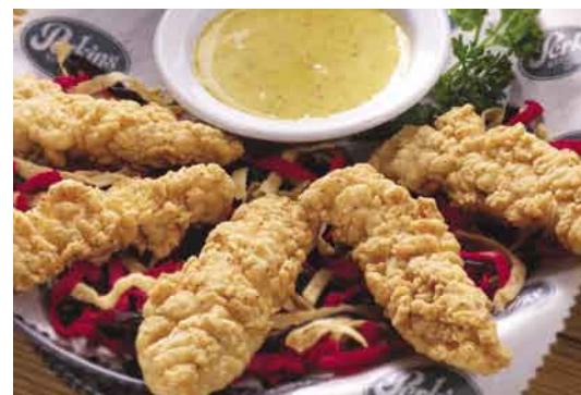
Chicken Tender Crisps