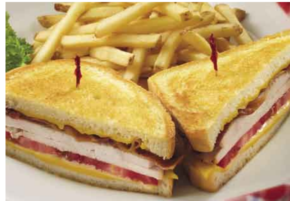
Country Club Melt

Butterball® turkey, bacon, tomato, American cheese and Thousand Island dressing on sourdough bread.