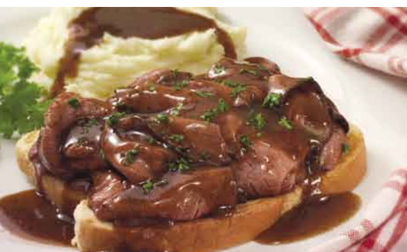
Open-Face Roast Beef