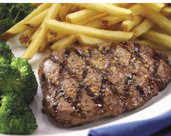
7 oz. Top Sirloin Steak