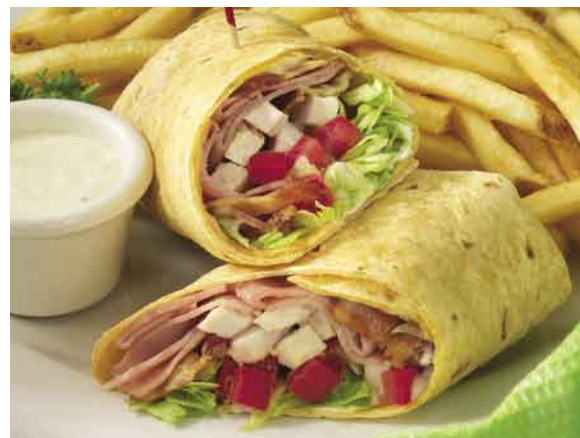
Ham & Turkey BLT

We proudly serve Applewood smoked bacon and hand-carve our own Butterball® turkey breast.