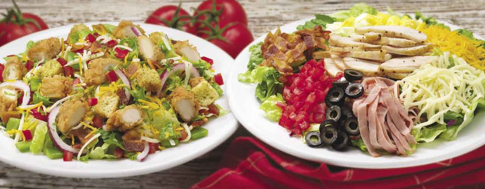
Honey Mustard Chicken Crunch and Chef Deluxe