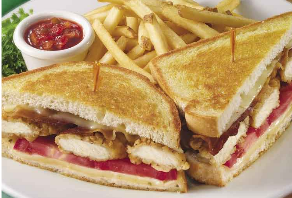
Chicken Tender Melt